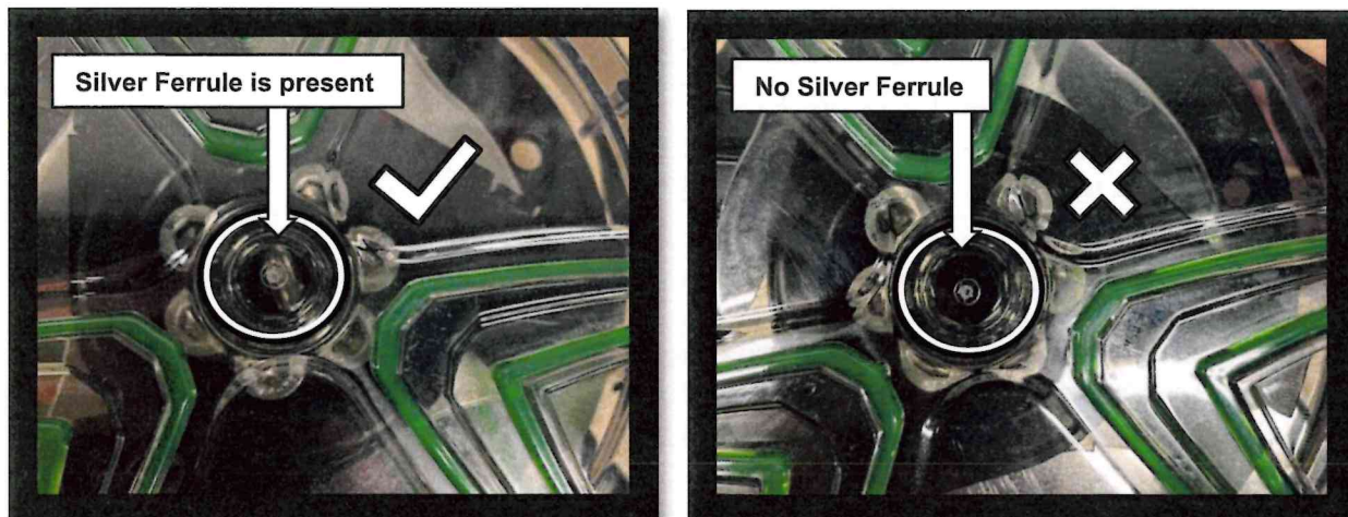
Figure 2 – Visual Inspection for Ferrule